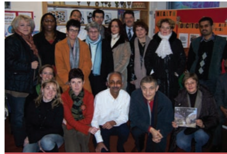
DiGe_E Participants Visit Liverpool Arabic Centre

In December 2005, 14 guests from our European partners along with 4 guests from Merseyside were invited to Liverpool to take part in testing, developing and adapting this course. The partners in this project were: LfQ - Germany (co-ordinator), MEH - United Kingdom, IUK Institut - Germany, VDAB - Belgium, VFA - Greece, SIF -Lithuania, LT, Europraxis - Portugal and South Savo Educational Federation of Municipalities/Mikkeli - Finland.