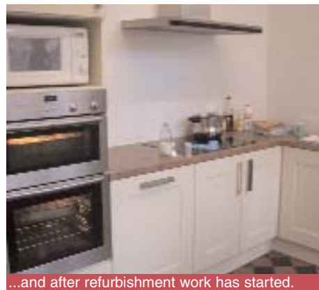
...and after refurbishment work has started.

The Social Capital funding covered the cost of renovation work required to make the kitchen more practical for workshops. This included new appliances and catering equipment and also protective clothing such as aprons, hair nets, footwear and safety equipment. Although work has not been completed, the kitchen has now been transformed into a usable kitchen with a safe and accessible working area.