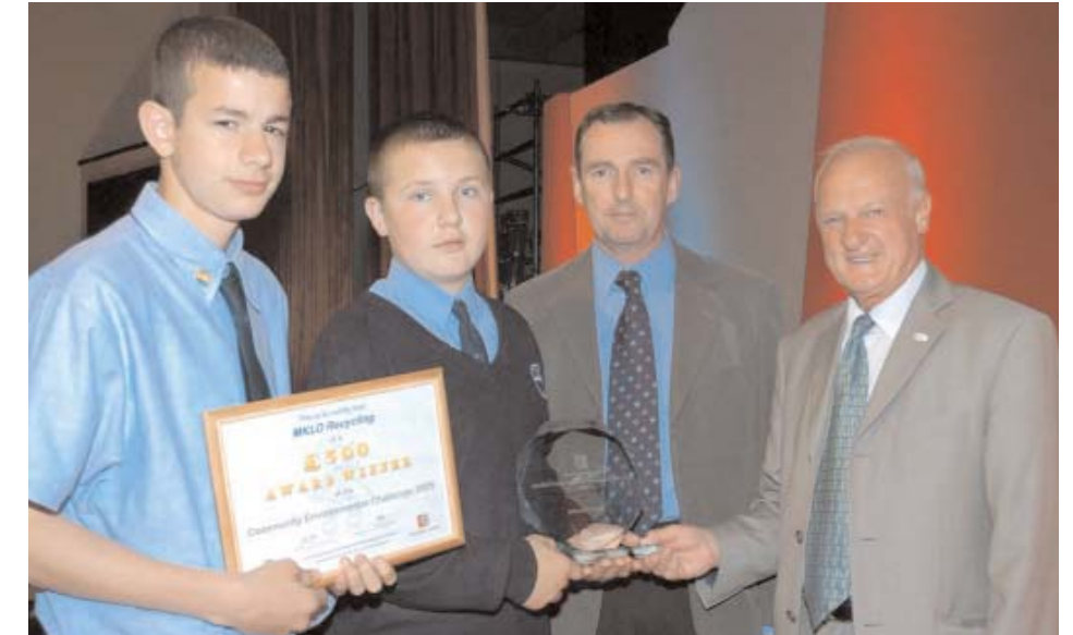
Children from MKLO project awarded trophy and £500 at the Knowsley Environmental Challenge Award, 2005.

Our work has been supported by Merseyside Expanding Horizons plus other Organisations. One example of how our work is tackling a range of