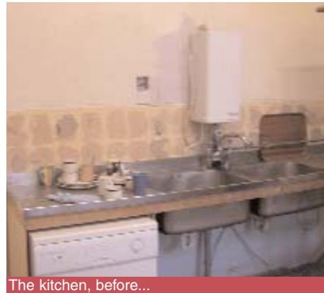
The kitchen, before...

The old building the centre inhabits on Lark Lane, South Liverpool used to be a Police Station but has been home to the Centre since 1985. Due to the age of the building many problems affect the structure and interior. The kitchen situated on the ground floor was badly affected. The existing kitchen was in a very poor state with inadequate cooking facilities. This was a major problem for the Staff because the kitchen is central to the new project.